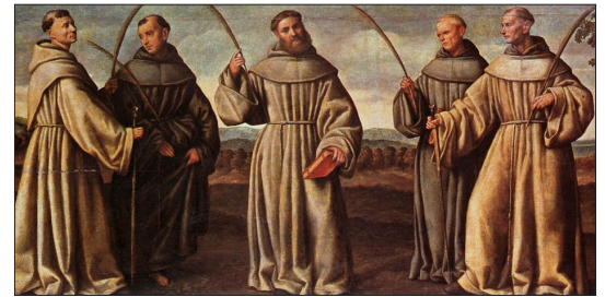
Saint Berard & Companions, First Martyrs of the Franciscan Order – January 16