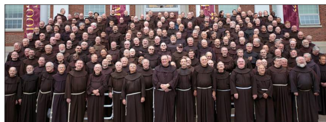
The Friars of Holy Name Province at a recent Chapter at Siena College.

Holy Name Province is the largest of seven provinces in the United States belonging to the Franciscan Order. It covers the eastern seaboard with some locations beyond. The Provincial headquarters are located here at St. Francis Friary in New York City.