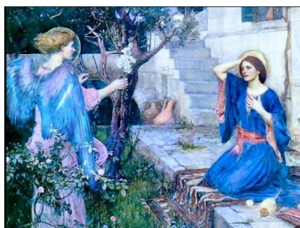
The Annunciation of the Lord, March 25