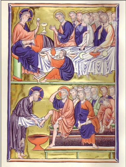
Scenes from the Last Supper in the Ingeborg Psalter, an illuminated manuscript from the late 12th century. It was created about 1195 in northern France for Ingeborg of Denmark, wife of King Philip II of France.

ST. FRANCIS HOUSE: 135 W. 31st Street • SAN DAMIANO HALL: 127 W. 31st Street ST. FRANCIS ADULT EDUCATION CENTER: 139 W. 31st Street