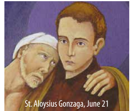
St. Aloysius Gonzaga, June 21