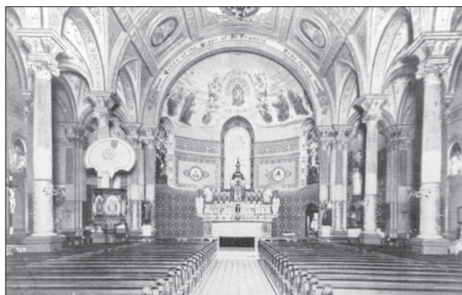
The earliest photo of the interior of the present church, shows the central window in the apse directly behind the altar before the installation of the Great Mosaic in the 1920's. That window, St. Francis in Glory, can now be seen in the 31st Street vestibule of the church.