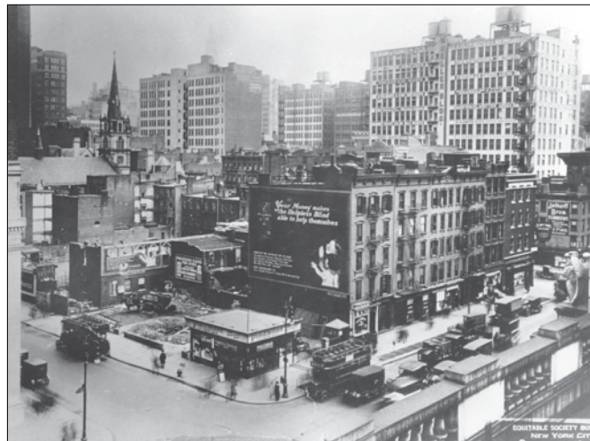
In this photo, taken from atop Pennsylvania Station in the 1920's, shows the neighborhood surrounding St. Francis Church (seen in the upper left).

Francis Church. Department stores and businesses in the neighborhood were booming, and shoppers and workers found the church a warm welcoming spiritual center. St. Francis Parish had few remaining parishioners, but thousands of devotees were finding their way to the Franciscan church between 6th and 7th Avenues. The attractive sanctuary developed into a Service Church for the people, a new model of urban ministry.