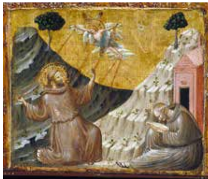
The Stigmata of St. Francis of Assisi, September 17