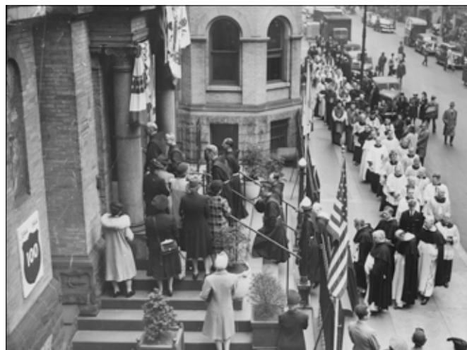
The procession of clergy into the church for one of the 100th anniversary Masses held October 4-8, 1944.