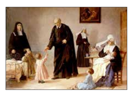
St. Vincent de Paul, September 27