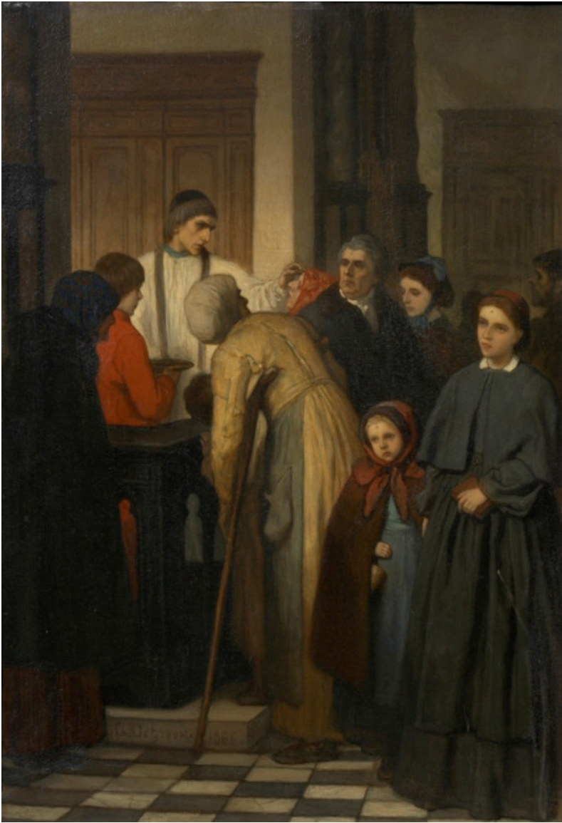
Charles de Groux, Ash Wednesday. Oil on panel, 1866. Stedelijk Museum Wuyts-Van Campen en Baron Caroly, Liere, Belgium.

Church of Saint Francis of Assisi • 135 West 31st Street, New York, NY 10001 tel 212.736.8500 • www.stfrancisnyc.org